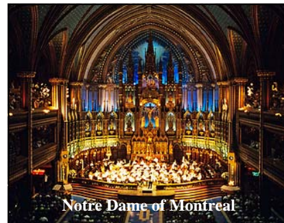
Notre Dame of Montreal

The course is open to Undergraduate and Graduate students. Acceptance into the program will be based upon several factors including a 2.5 GPA, an interview with the program advisors, motivation, and interest in the program.