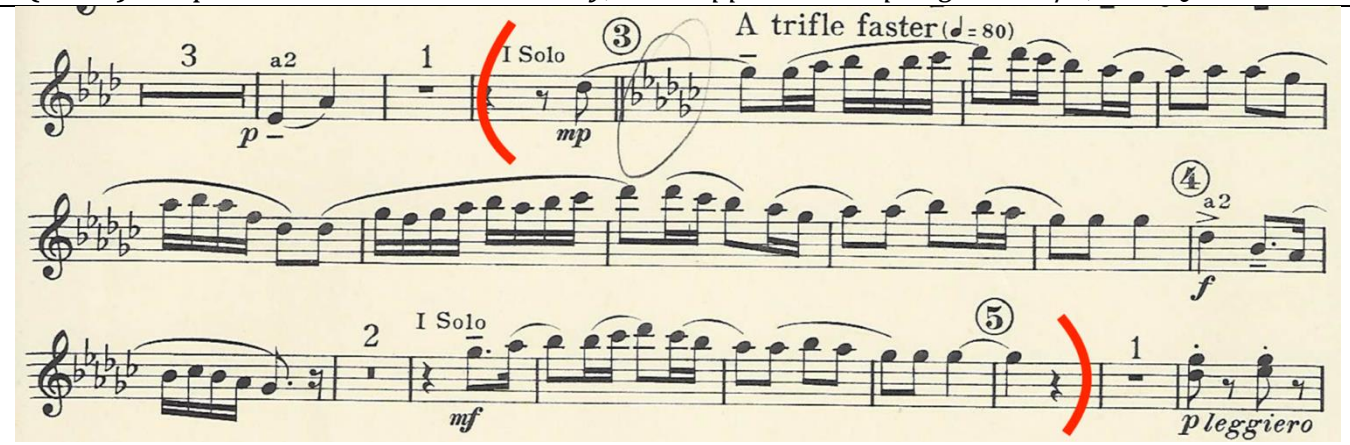
#5 - (Oboe) Hindemith: Symphony in B-flat, mvt. I (Hindemith excerpt #1) .... In 3/2, mm. Half = 88-92