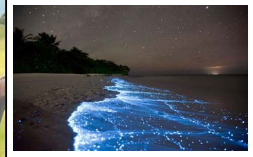
Kayaking to the Bioluminescent Bay