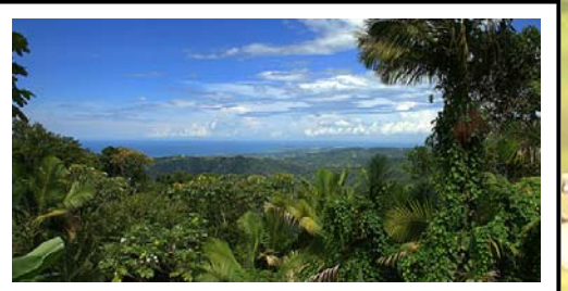
El Yunque Rainforest