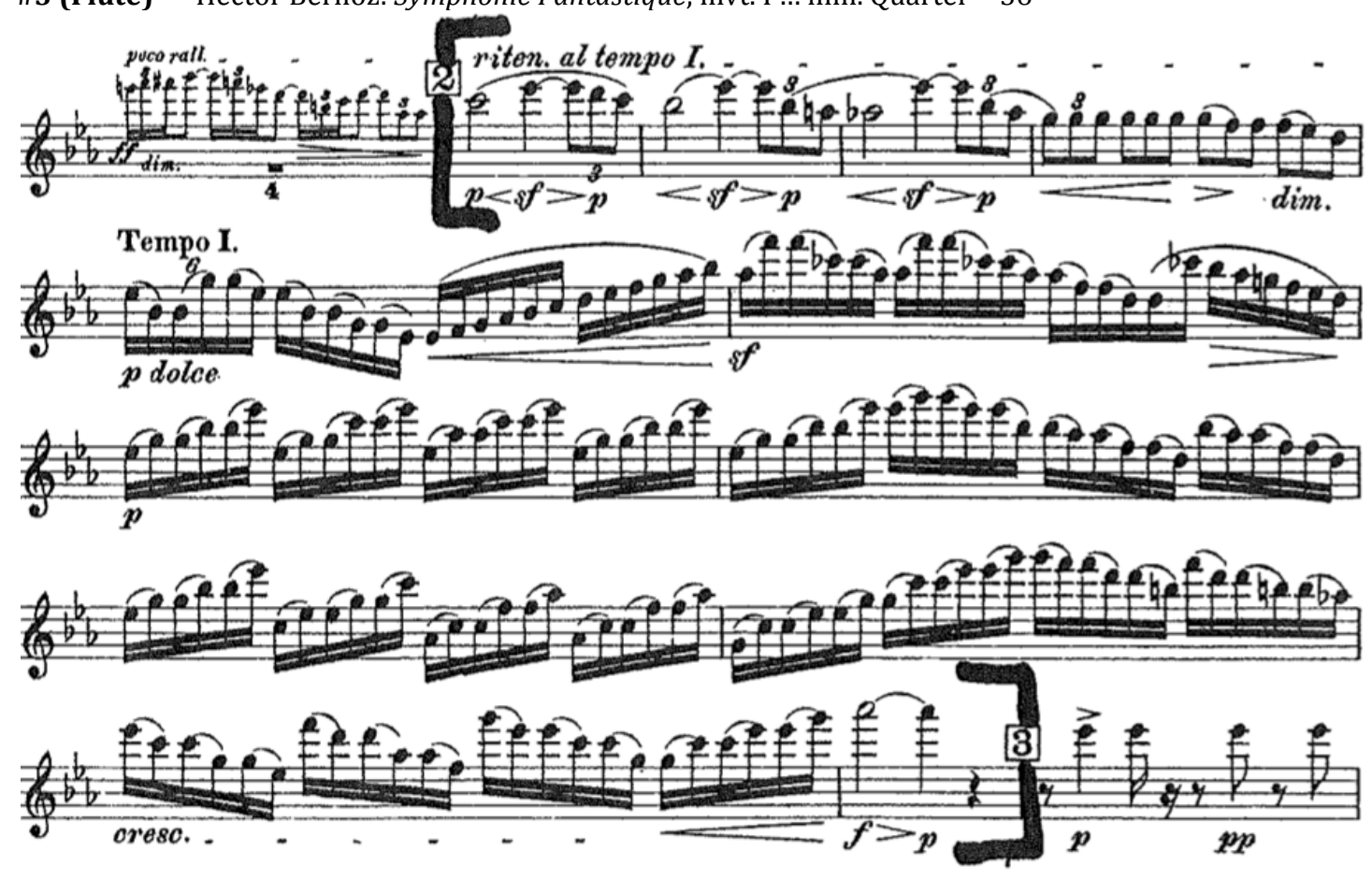
Hector Berlioz: Symphonie Fantastique, mvt. I ... mm. Quarter = 56 #3 (Flute)