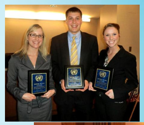
Individual awards won by WSU students at DAYMUNC

Meet and work with students from all over the world